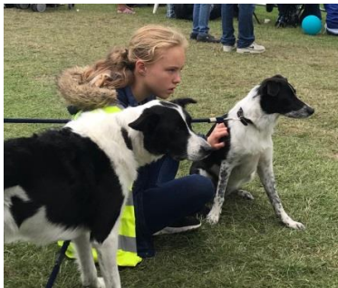
A member of 'Team Teen' at work!

You also provided a very imaginative range of catering and lots of interesting stalls where we enjoyed talking to the vendors and buying some of their products.