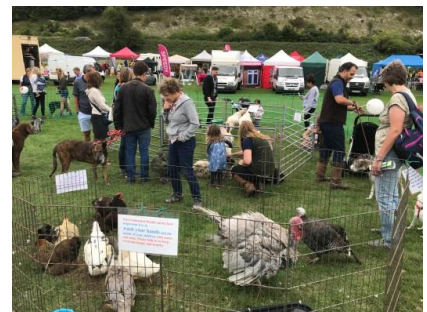
Miller's Ark Animals