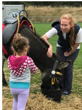
Hayling Island Donkeys