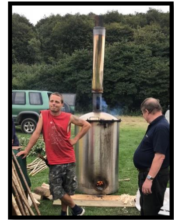
Making charcoal with Three Copse at their stand