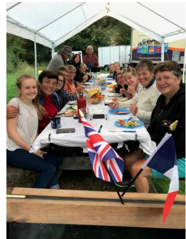
Our amazing Crew – truly truly amazing!!